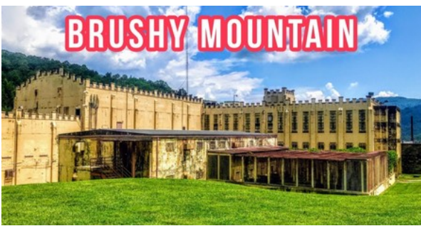
Self-guided Tour and BBQ Lunch

Join us on June 19th for our trip to tour Brushy Mountain Penitentiary! We'll leave at 10:00 am to head out, and upon arriving, we'll have lunch at their BBQ Restaurant and then go on a self-guided tour of the prison. After lunch, there is also an option for a moonshine tasting.