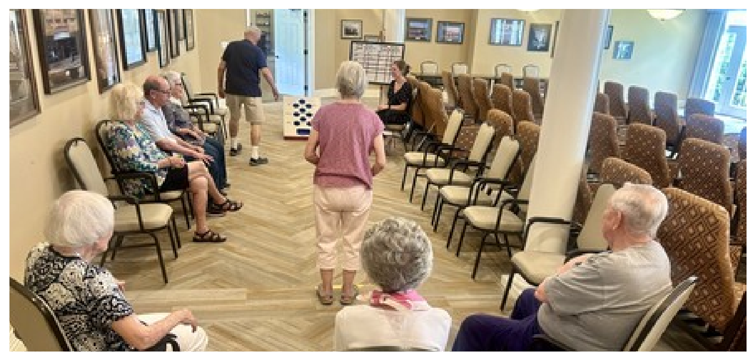
We have a competitive and fun game of Beanbag Baseball every Monday and Thursday at 2:00pm.