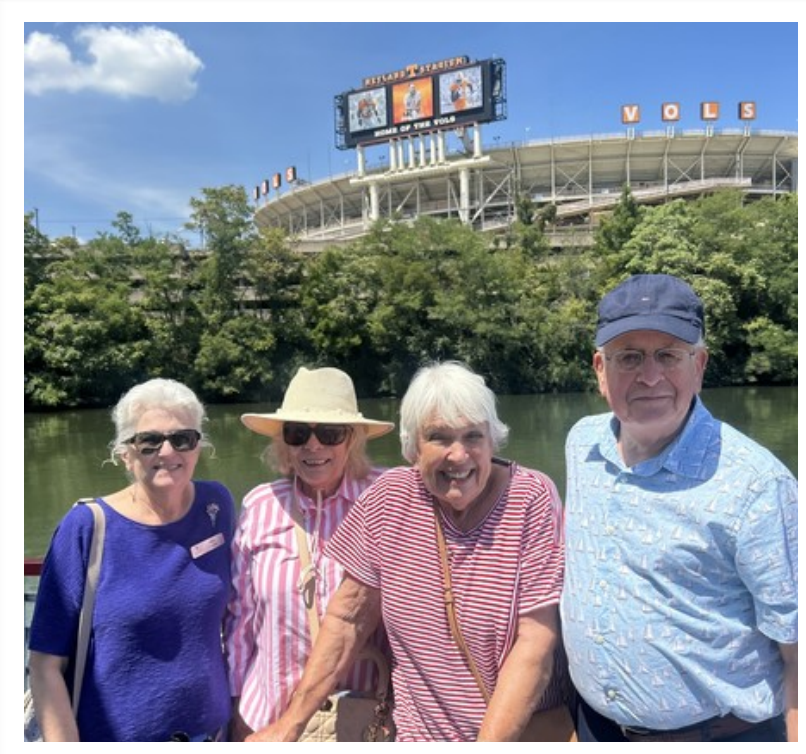
Tennessee Riverboat Lunch Cruise